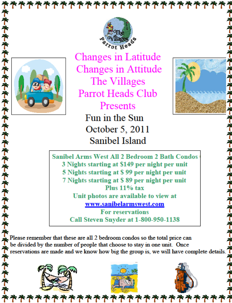
Photo of the Month