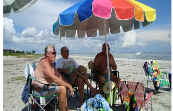
Village Parrot Heads relaxing on the beach at Sanibel Island, 2009

Rental Rates are 3 nights starting @149 per night 5 nights starting @ $99 per night 7 nights starting @ $89 per night Plus 11% Tax