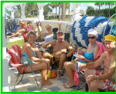
2009 Annual Pool Party at Lake Miona Sports Pool

This is a member only event, so for those of you who have not renewed your membership, please stop by the Membership table before purchasing tickets.